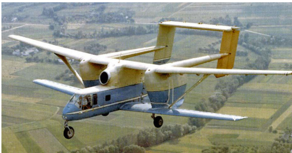
PZL M-15 Belphegor

After last month's craziness regarding biplane jets, the fastest biplane, all that...I kept wondering about biplanes, and I wondered if there was ever a jet biplane that carried people, and in the process I actually found proof that there were committed crack users in the Soviet Union in the 70s. To wit, they built a jet-powered crop duster. I don't know exactly what happened to prompt this other than that somebody decided to build a 'modern' ag plane for the huge collective farms running at that time. I'm sure some fine aero engineers were consulted and ignored.