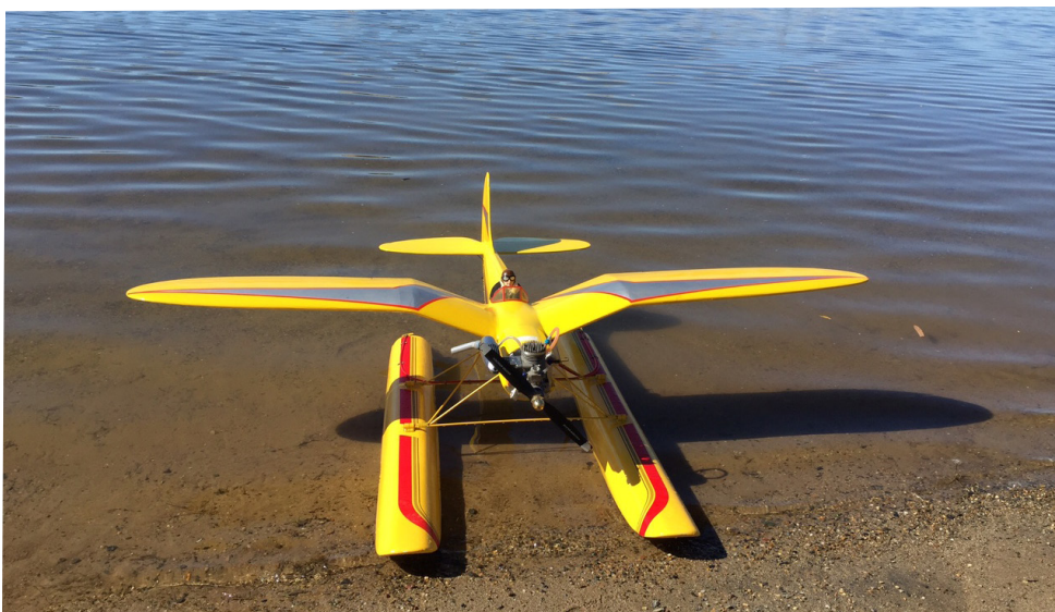
Lake McSwain Float Fly September 23, 2016