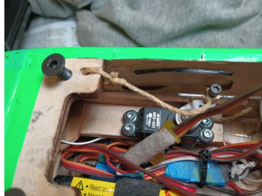
Aft Wing Mount