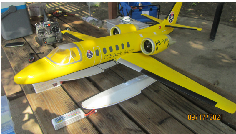
Lake McSwain September 2021 Float Fly Photographs from Ron Scott: