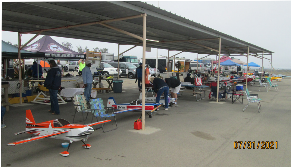
Santa Maria Giant Scale Event July 2021