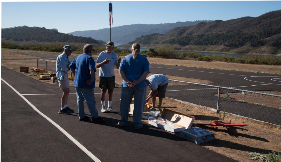
Ventura County Comets "Fun Fly & BBQ" August 28, 2021.