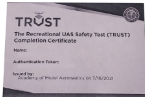
Trust Certificate Example

https://trust.pilotinstitute.com/?gclid=EAlalQobChMIInqm0x8Sq8gIVBAmRCh3LEQFiEAAAYASAAEgLWp_D_BwE