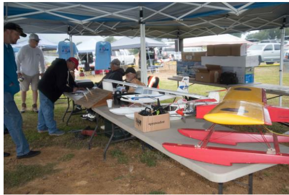
Pilot Check-in and Plane Inspection