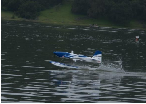
Touch and Go