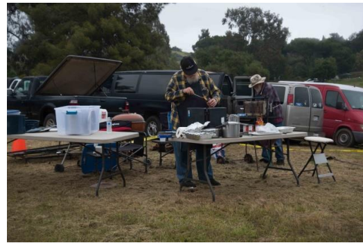
The BBQ Cooks