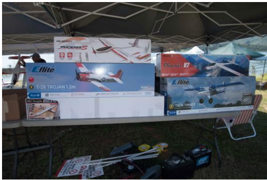
The Raffle Prizes