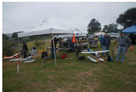
Planes Ready to Fly