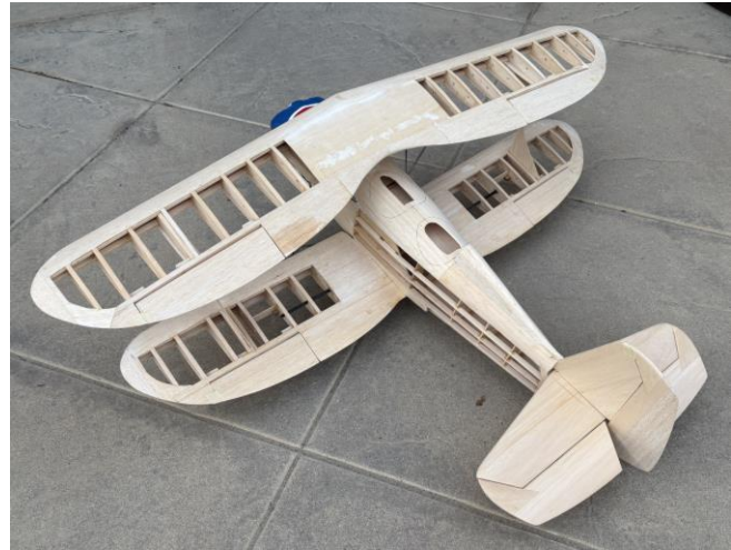
Update: How it looks this week

Doug O brought a Klingberg wing 100, 100" wing span. Currently at the stage to sheet the wing.